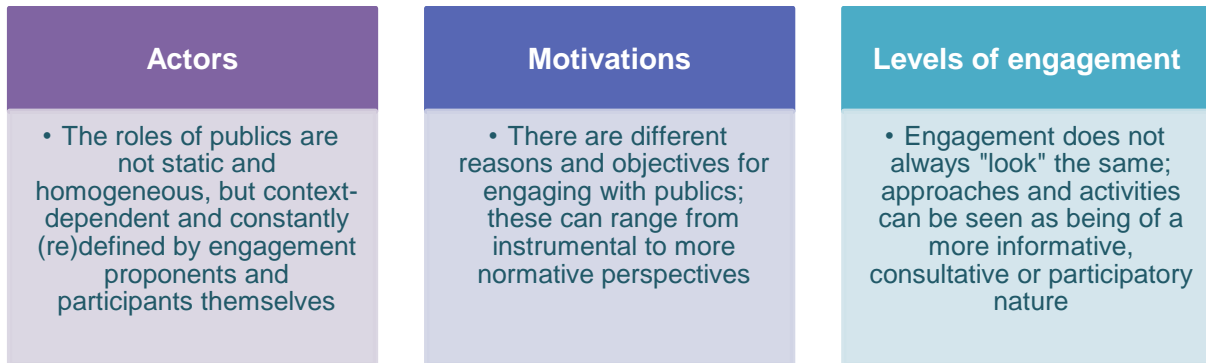
Figure 1: Outline of an analytical framework for public engagement in BioSTEP

We first explore each of these dimensions in sections 2 to 4, before proposing a series of questions that are intended to facilitate reflection in BioSTEP regarding what public engagement might mean in this project (Section 5).